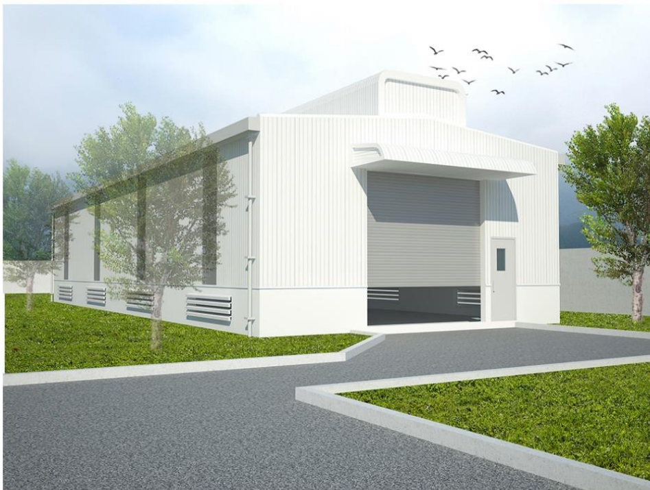
DỰ ÁN: WAREHOUSE NISSHIN SEIFUN ĐỊA CHỈ: AMATA IP, BIEN HOA, DONG NAI