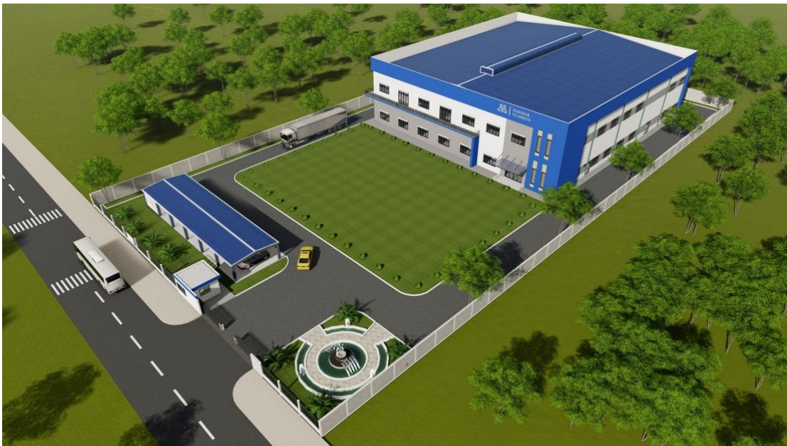
DỰ ÁN CÔNG TY TNHH MANOHAR FILAMENTS (VIETNAM) TẠI VSIP II-A ĐỊA ĐIỂM: TỈNH BÌNH DƯƠNG-VIỆT NAM